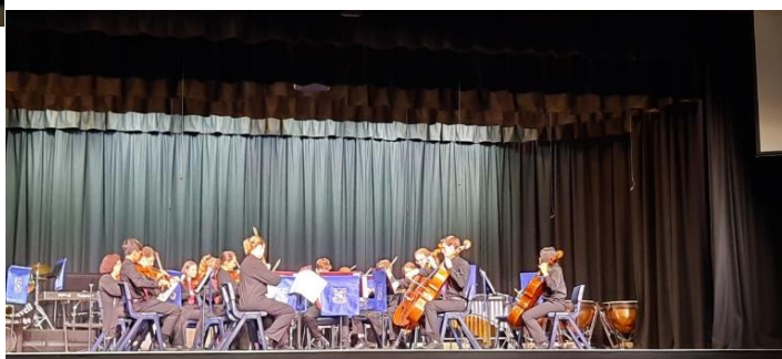
Senior Chamber Strings