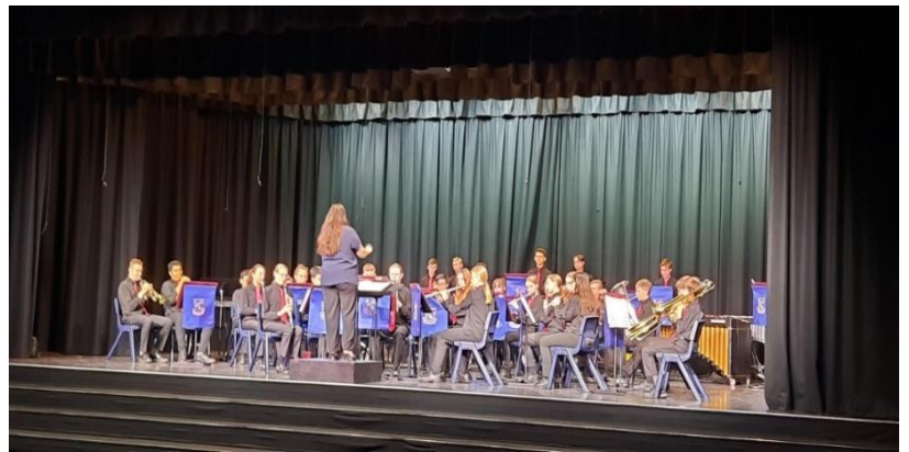
Junior Concert Band