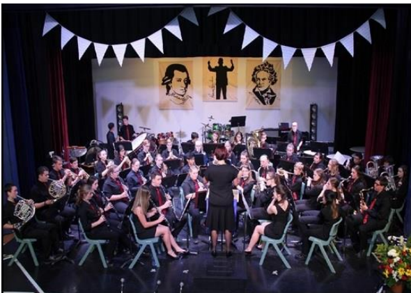
Symphonic Wind Ensemble

Students in year 11 and 12, who are studying level 7 or higher are eligible for 1 QCE point per year towards their Qld Certificate of Education. They must successfully fulfil stringent requirements of assessment, practice and 55 hours of contact (weekly lesson and rehearsals). Samples of assessment are moderated at a district and state level, where applicable.