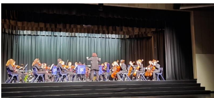
Junior String Orchestra