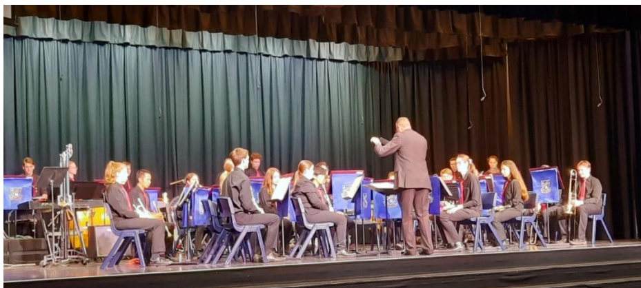
Symphonic Wind Ensemble