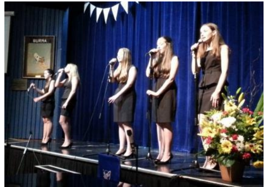
Rapport Vocal Quintet